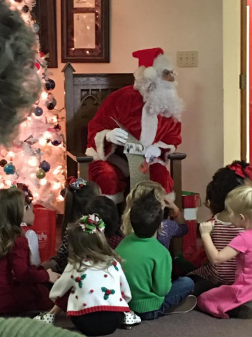
Merry Christmas from Children's Learning Center